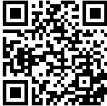
Wrestling With God QR Code

*Please note on 2/16 Wrestling With God is meeting in Assembly Hall*