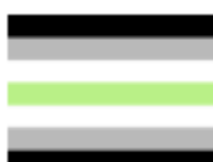
Agender Pride Flag