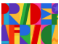
Pride of Africa Flag