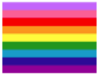
Gilbert Baker Pride Flag