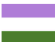
Genderqueer Pride Flag