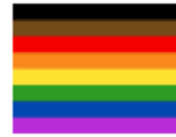
Philadelphia Pride Flag