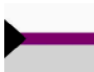
Demisexual Pride Flag