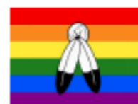
Two-Spirit Pride Flag