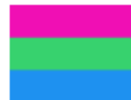
Polysexual Pride Flag