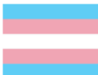
Transgender Pride Flag