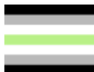
Agender Pride Flag