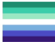
Trans-Inclusive Gay Men's Pride Flag