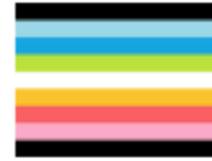
Queer Pride Flag