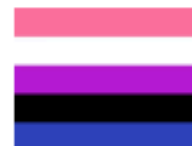
Genderfluid Pride Flag