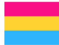
Pansexual Pride Flag