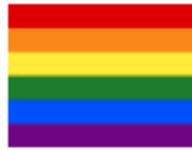
Traditional Pride Flag