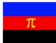
Polyamory Pride Flag