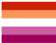
Lesbian Pride Flag