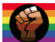
Queer People of Color Pride Flag