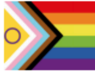
Intersex-Inclusive Progress Pride Flag