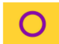
Intersex Pride Flag