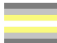
Demigender Pride Flag