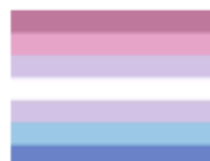
Bigender Pride Flag