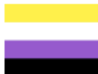
Nonbinary Pride Flag