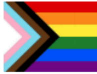
Progress Pride Flag