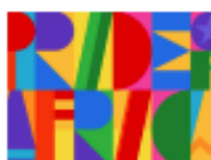
Pride of Africa Flag