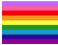
Gilbert Baker Pride Flag