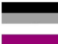
Asexual Pride Flag