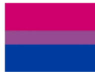
Bisexual Pride Flag