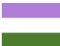
Genderqueer Pride Flag