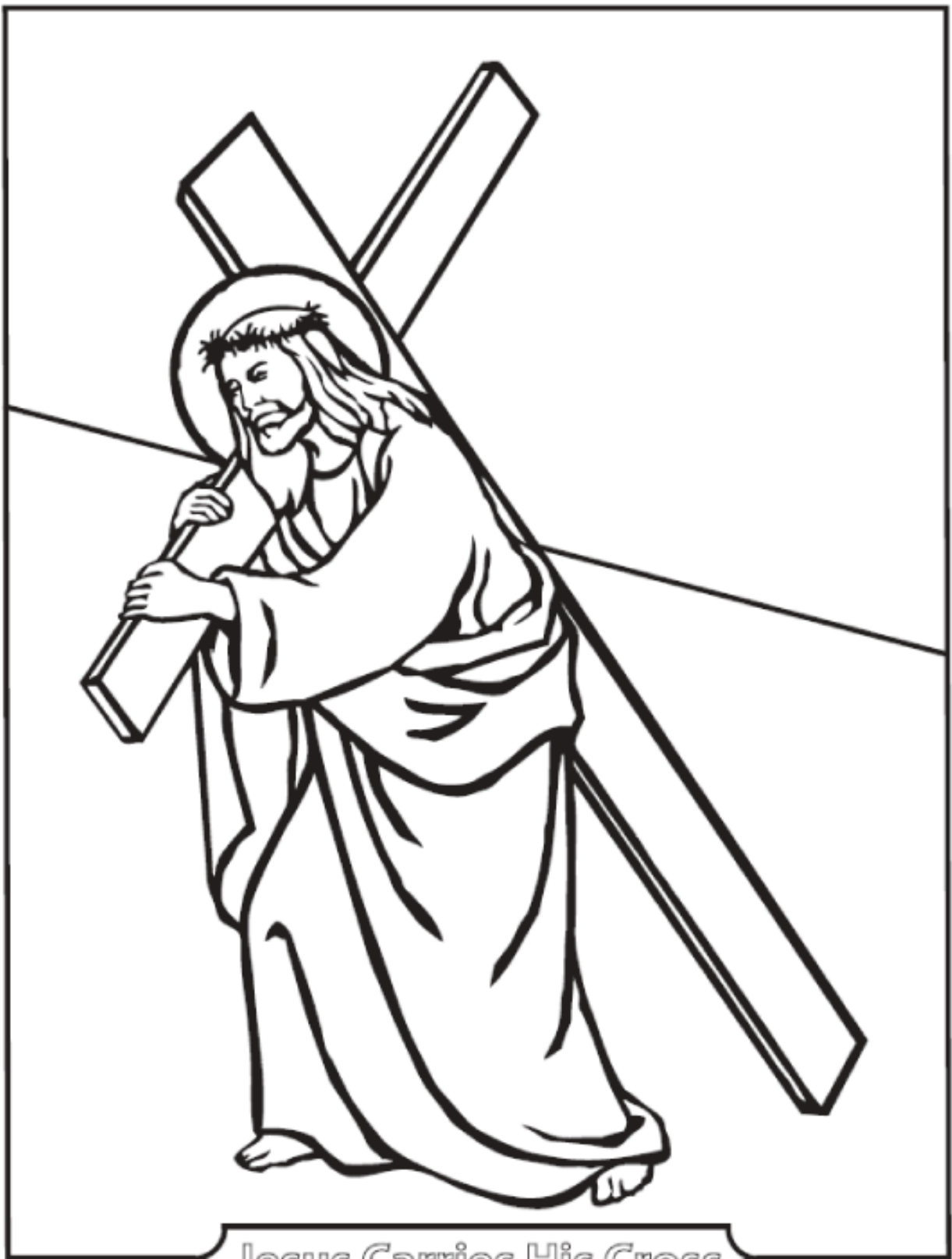
Jesus Carries His Cross