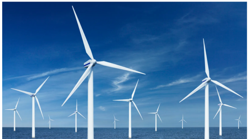
Offshore wind turbines, such as these giants, are envisioned as the cornerstone for "green" energy production in New York. Michael Betts